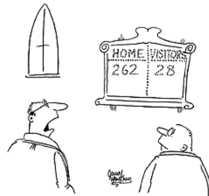
"There must be another way to record attendance for our services."

Life is a blessing. Use yours to bless others.