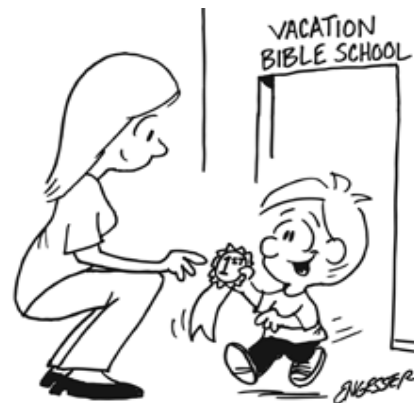
"Got first place in Bible trivia by being a Noah't all!"

Cash is used to purchase goods by the pound, at a great discount. Please make checks out to Aldersgate and note 'Food Pantry' in the memo line. Thank you!