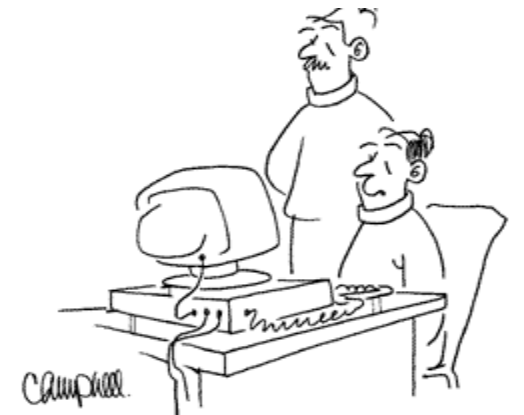
"Remember when we could count our blessings without a spreadsheet program?"

Join us from 9 a.m. to 2 p.m. for a leisurely walk through the zoo, visit the many vendors with great information for the 'over 50' crowd, and enjoy the entertainment on a day filled with fun for everyone.