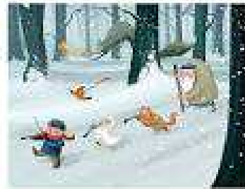
CHILDREN'S CONCERT (For Kids 1 to 100)